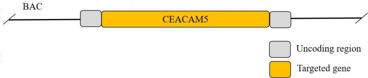
Fig.1 The CEACAM5 gene humanization strategy

Human CEACAM5 was randomly integrated into the genome.